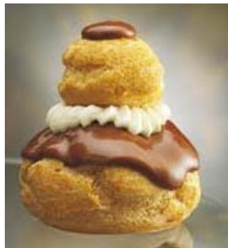
Original classic recipe