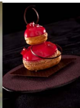
Classic Recipe Revisited